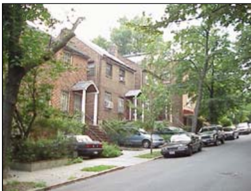
Proposed R4A on west side of Cannon Place north of West 238th Street

Recognizing this disparity between the existing built environment and what is permitted under current zoning, the community has raised concerns about the impacts of potential overdevelopment on neighborhood schools, parking, and social services. In its 197-a plan, the Community Board has therefore recommended rezoning the area to lower and mid-density contextual districts, which would maintain the unique character of this community.