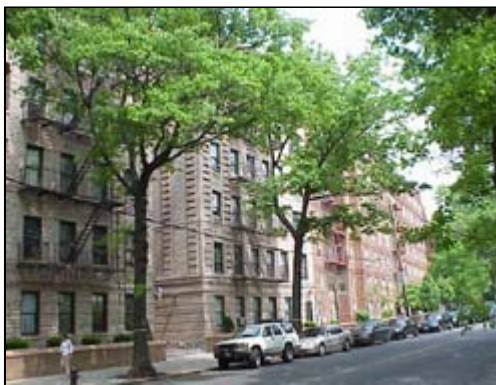
Proposed R6A on west side of Sedgwick Avenue south of Giles Place